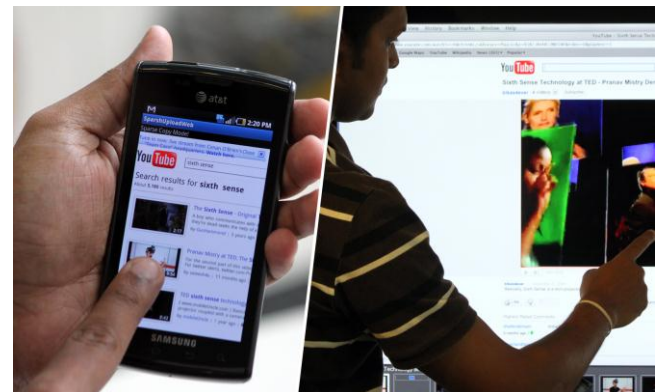
Figure 5. Moving a video link from a mobile screen to a larger digital display.

You see a video posted on Facebook on your phone. You want to watch the video with your friends on a larger screen. Touch the link, and pass it to a larger screen by touching and enjoy the video (Figure 5).