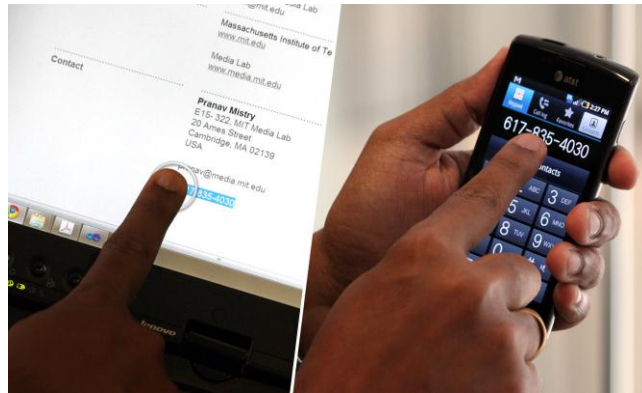
Figure 3. Copying a phone number from a computer to a mobile phone.