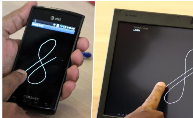
Figure 6. Identifying user by using a unique gestural sign.