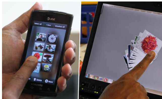
Figure 4. Copying pictures from a phone to a tablet computer.

Want to get a copy of the pictures your friend took during a party using his mobile phone camera? Simple, touch the pictures you want to copy and when you are home, you can paste the photos to your tablet computer by touching its screen (Figure 4).