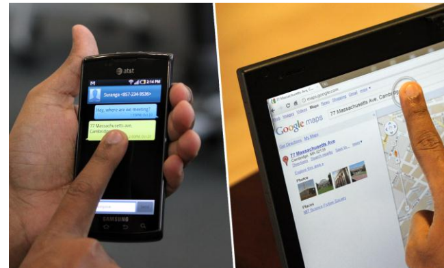
Figure 2. Transferring an address received in an SMS from a mobile phone to Google Maps on a computer.

Imagine you received a text message on your mobile phone from a friend with the address you are meeting him at. You touch the address and it gets conceptually copied in you. Now you pass that address to the search bar of Google Maps in a web browser of your computer by simply touching it (Figure 2).